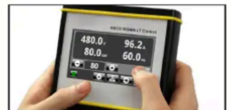
Optional SIGMA LT Hand-Held Terminal.

SIGMA software can be updated free of charge through the ASCO website at the following link .